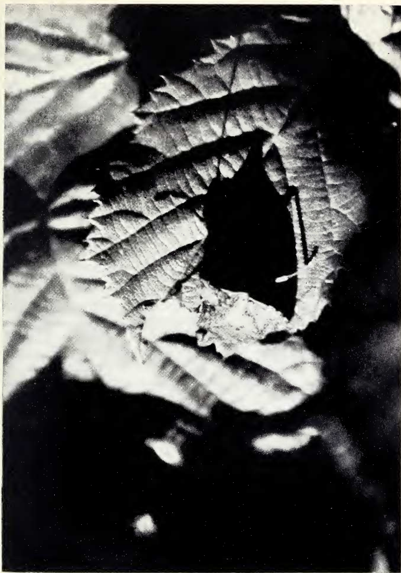
Fig 3. A stinkbug photographed in the morning with its back presented directly to the sun with the bug assuming the "tilt" position.